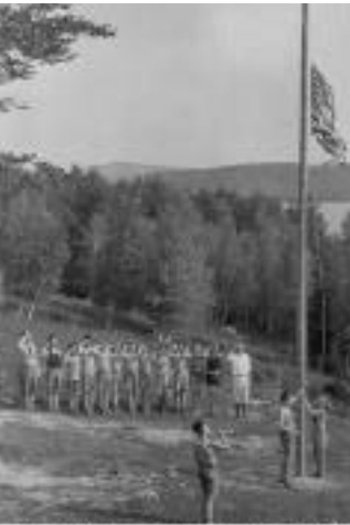
First flagraising, July 4, 1926

A unique feature of the new camp’s land was a birch tree that had seeded itself atop a large boulder near the shore. It appears that Bill went to talk with Hugh Pendexter, a Norway author of children’s adventure stories, about a name for the new camp. Rejecting the convention of Indian names for camps, Pendexter suggested naming it for something like a unique natural feature of the place. The choice was obvious, and Birch Rock Camp it became.